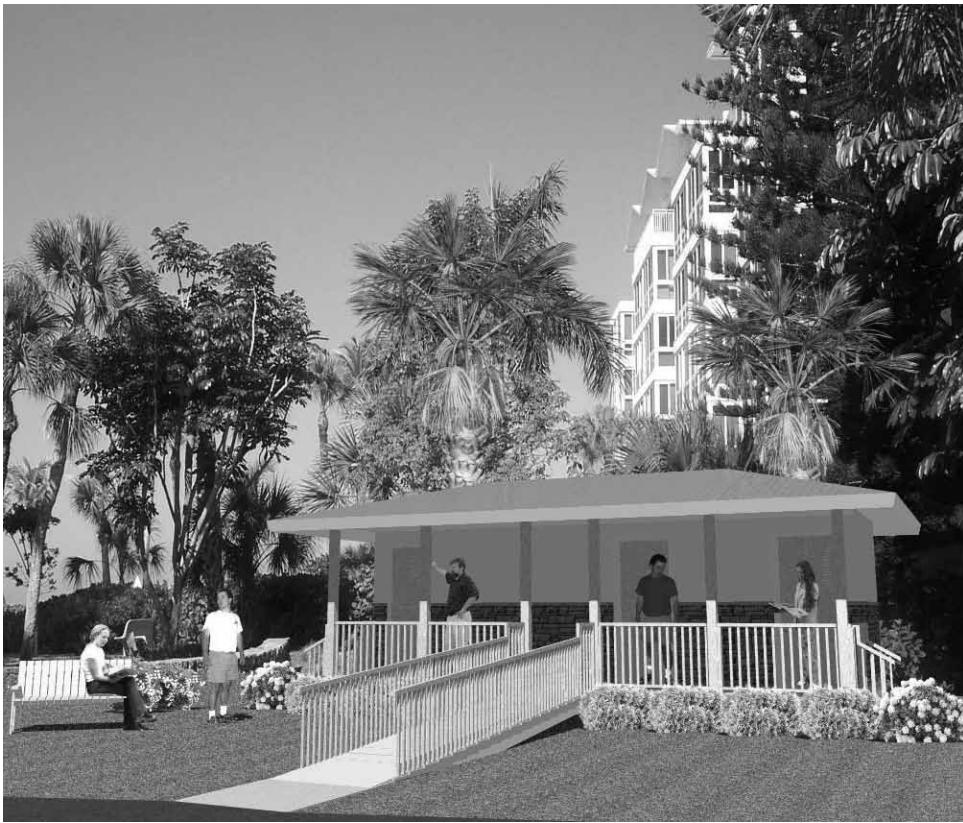
Architectural Rendering of the Proposed Restroom Facilities at the Beach Park.